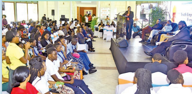
A student poses a question to the panel discussing 'Technology and Innovation' at the Youth Empowerment Forum hosted by the DFED.

DIVISION OF FINANCE & ENTERPRISE DEVELOPMENT