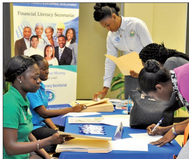
Hardworking members of the Financial Literacy Secretariat register participants taking part in the Financial Fitness Programme hosted by the THA's Division of Finance and Enterprise Development.

The applause at the end of the workshop was a clear signal that the participants appreciated the information that they