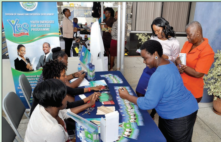
Visitors get information on the YES Programme at the booth hosted at the BDU Expo during Finance Week.

The Vision of YES calls for collaboration with other Divisions of the THA, the private sector and other local, regional and international agencies, to expand and enhance training, employment and entrepreneurial opportunities for young